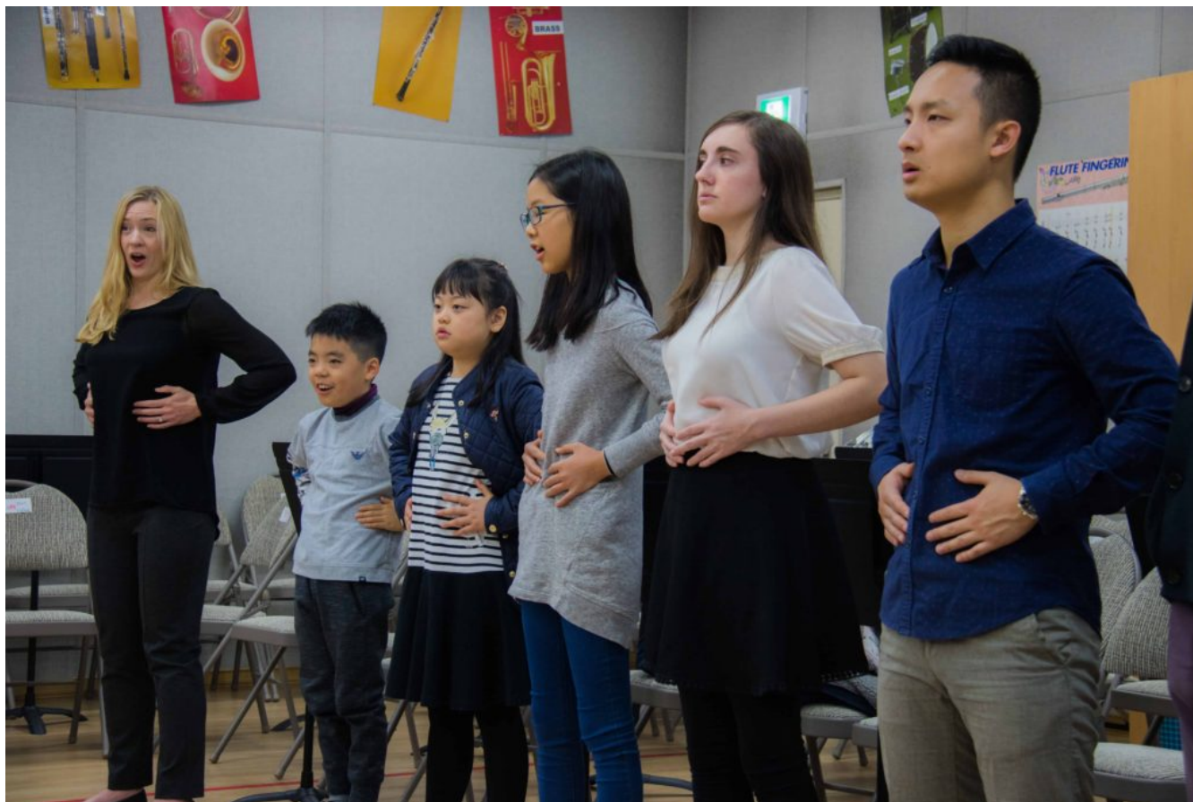
Students feel their diaphragm in action during the voice workshop

After the workshops, we congregated for a rehearsal in the school auditorium. We prepared for a shorter evening recital, and then had our second dinner in South Korea: pizza!