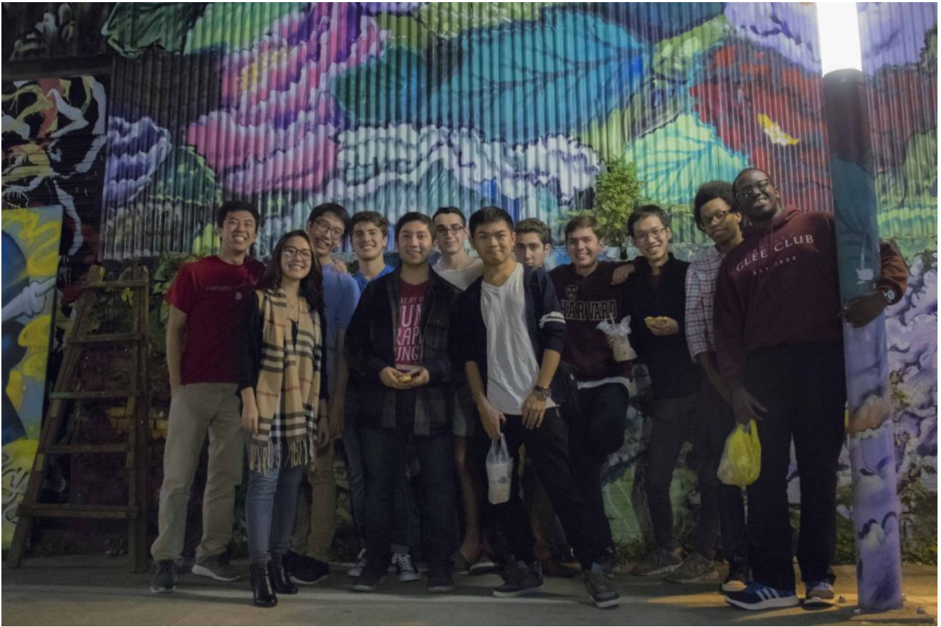
A group of Gleeks going out for dinner in Taipei in anticipation of the New Year

After dinner, the group split to go view see the fireworks at Taipei 101 from different places.