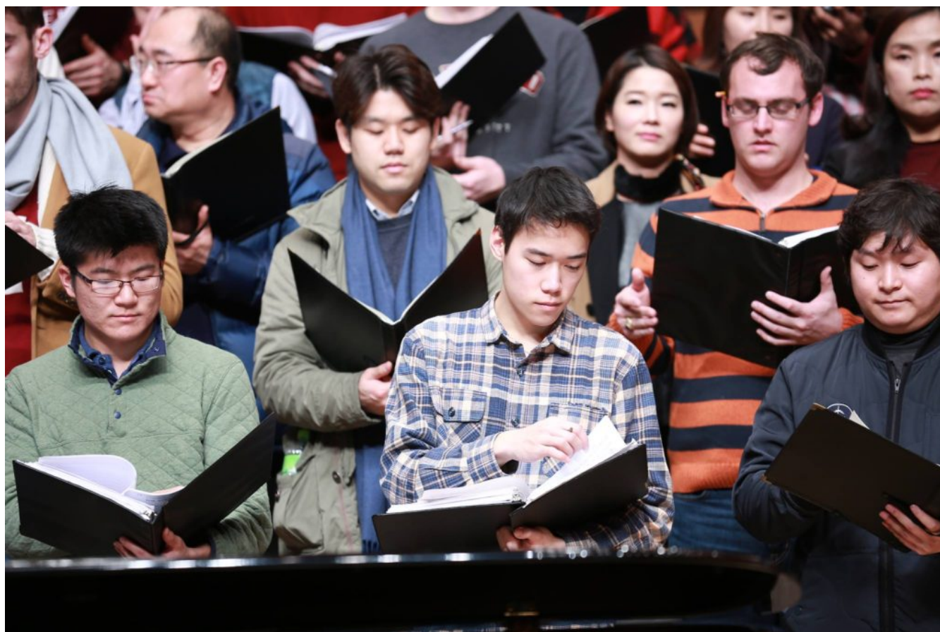
Gleeks rehearse amid the members of the Gunsan Civic Chorale

After the joint rehearsal, we had a bit of time to ourselves on the stage, and we went through our own set.