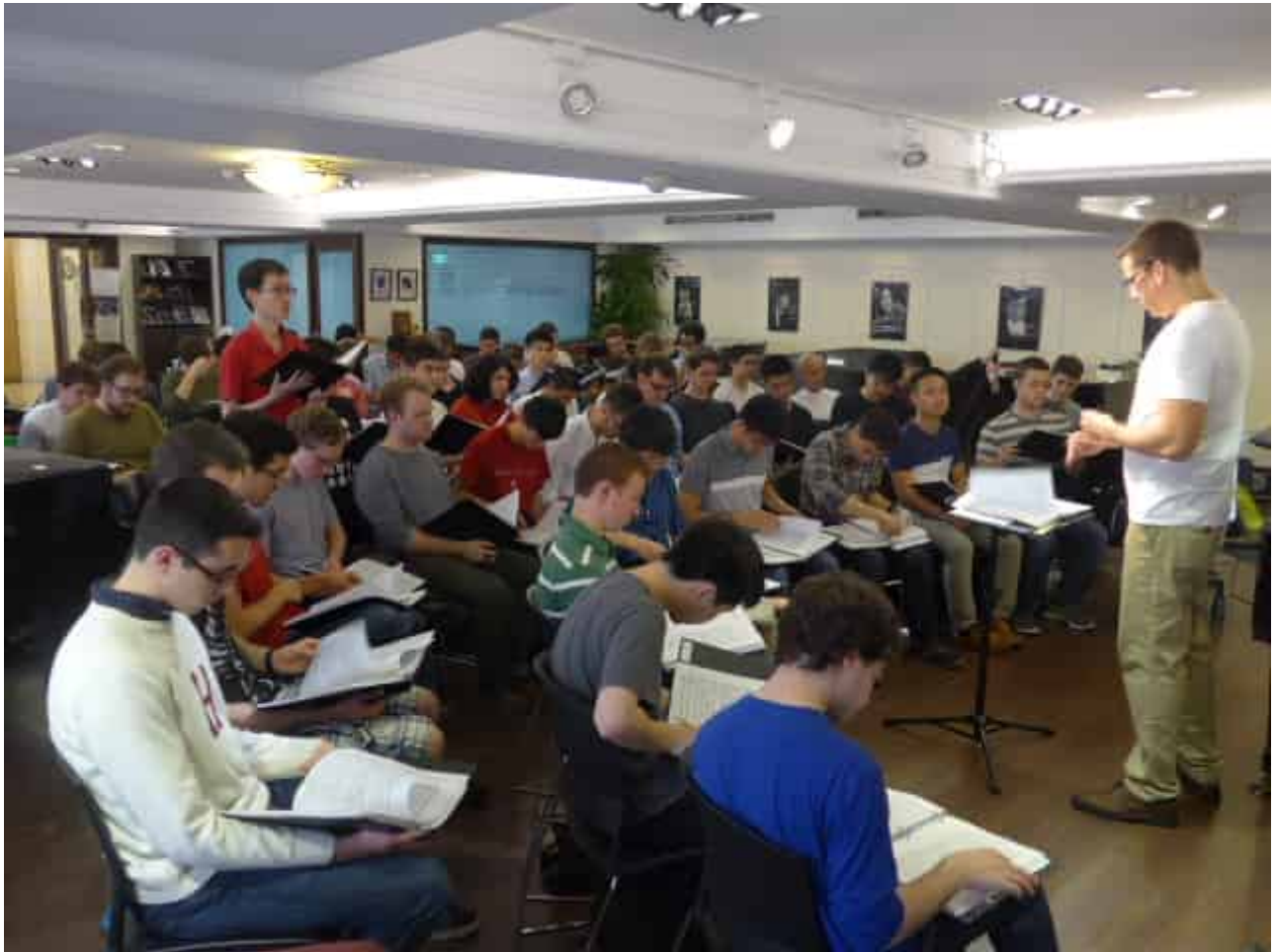
The Glee Club gets ready for their first rehearsal.