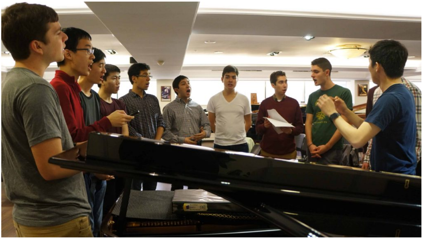
Lite assembles for their rehearsal in the piano shop

The final stop of the tour was a foray into the famous Shilin night market. We went to an underground food court and ate the local street food (cheap yet very yummy) in smaller groups. Then those wanting to head back to the hotel and sleep climbed back onto the bus; this counted most of us, as jet lag was kicking in. However some others chose to stay at the market, explore, barter with the shop owners, and play some of the endless games proposed.