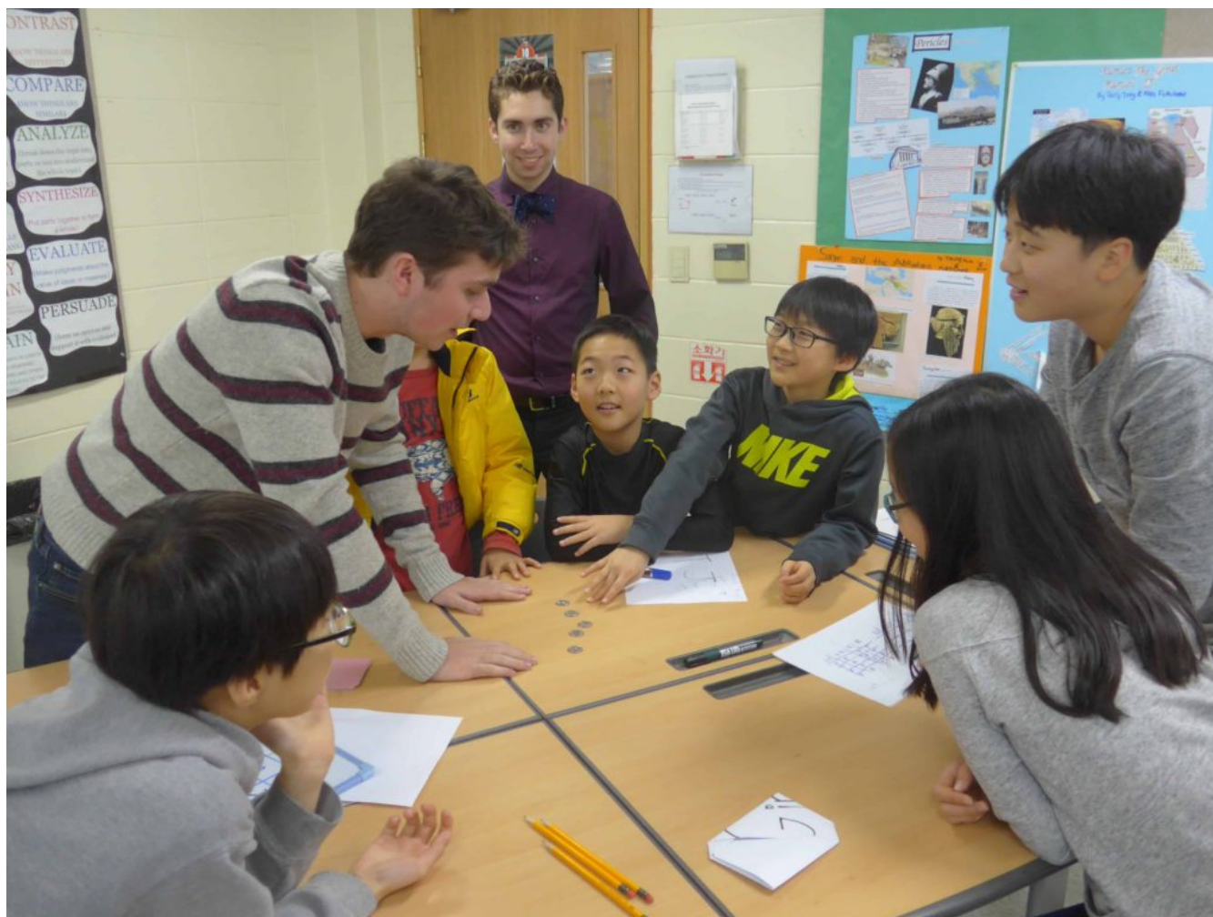
Students of varying age at the workshop

My group broached the topic of logic and reasoning. We gave them various puzzles, showed them the AND, OR and NOT tables, and even showed them some mathematical magic card tricks to make them work out the mechanism.