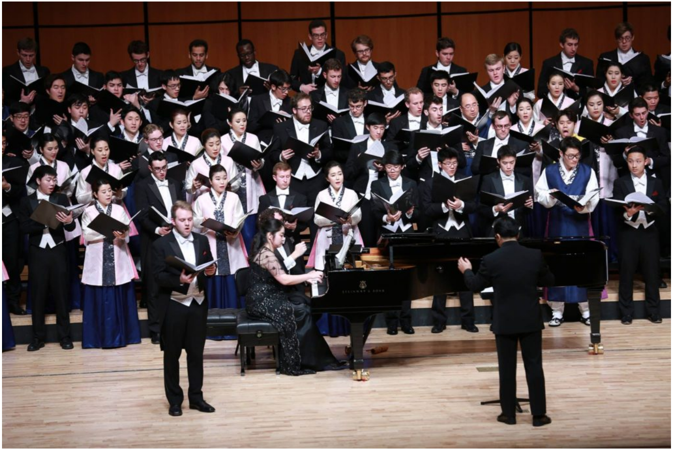
The two choirs combine to sing both American and Korean traditional songs