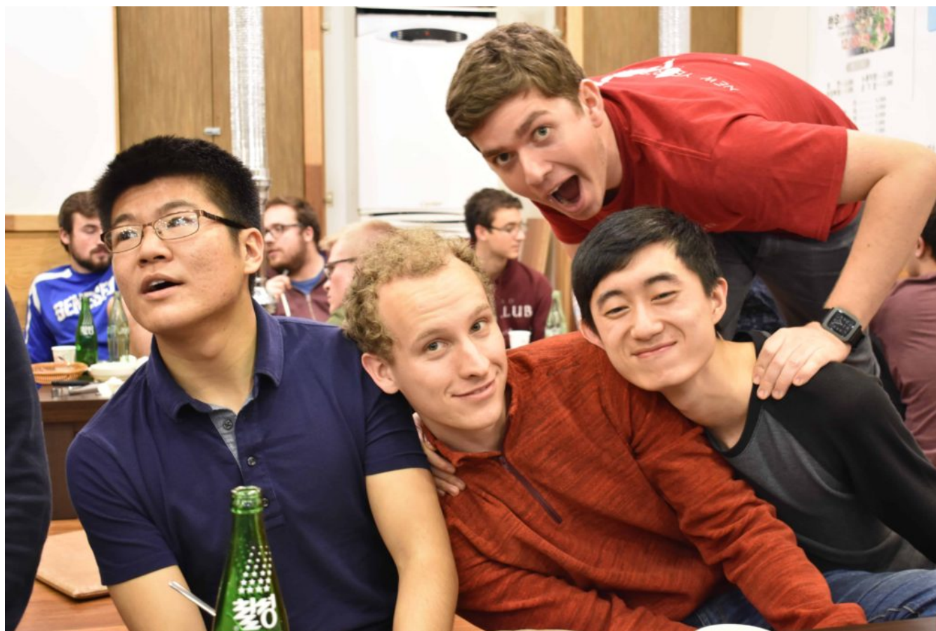
Shenanigans at the dinner

Soon after we re-boarded the bus, we arrived at the Korean International School and were shown our accommodations. The majority of us were to be housed in spacious four-person dormitory rooms' bunk beds. Though more modest than our Taipei accommodations, these rooms will certainly allow us a comfortable stay in Seoul; however, we noticed a few interesting quirks as soon as we arrived. First, the floor was again heated! This made going barefoot in the bedroom quite comfortable, making it easy for us to respect this aspect of Korean etiquette. Second, Wi-Fi was not available in the bedrooms! This forces students to congregate in common areas for web access, promoting the social scene at the school in a manner both clever and astounding. That night, we engaged in various activities, including planning for the next day's workshops with the Korean International School students, an outing to Gangnam, a poker night, and a Sherlock (the TV series) watching party.