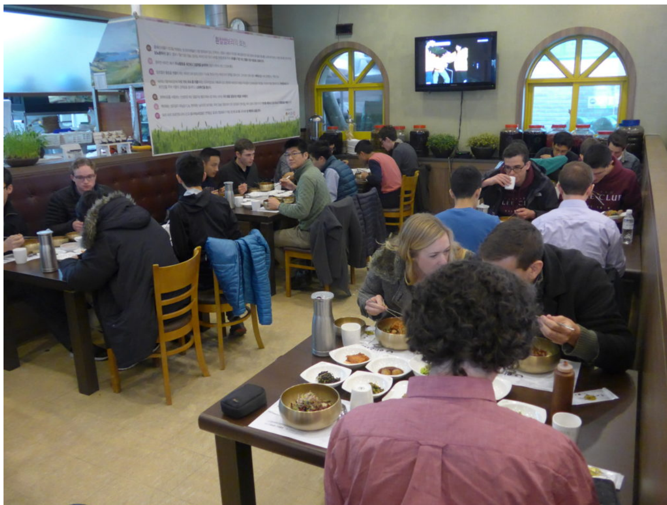
The restaurant “Arirang” which we stopped at to eat delicious bibimbap

When we arrived in Gunsan, we had lunch at a restaurant named “Arirang,” which is also one of the pieces we were singing in Korea. It’s a popular folk tune about a mountain pass, and most everybody in Korea is familiar with it. After lunch, we drove to the meeting point for our housing. According to the best approximate translation, we were going to be staying in Korean guest houses, sort of like a bed and breakfast joint. There were mats on the floor for us to sleep on, a spartan bathroom with a toilet, sink, and shower, and not much space for anything else. We just had time to say hi to our hosts and grab our music and tails before we were whisked off to the Gunsan Art Center.