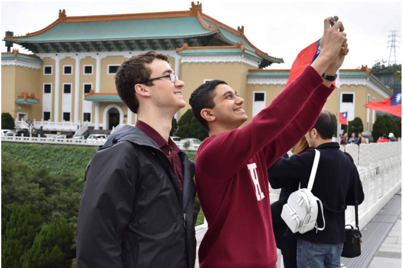
A selfie being taken at the National Palace Museum

Meanwhile, Lite, the A Cappella subset, left early from the tour to rehearse at the Management of New Arts building. After a somewhat rushed subway ride across the city, the subgroup was led to the eleventh floor of the building, which (lo and behold), was a Steinway piano shop. Lite rehearsed its repertoire for the upcoming concert, then was taxi-ed out to the National Palace Museum, had lunch on the steps of the museum, and went in to join the rest of the group.