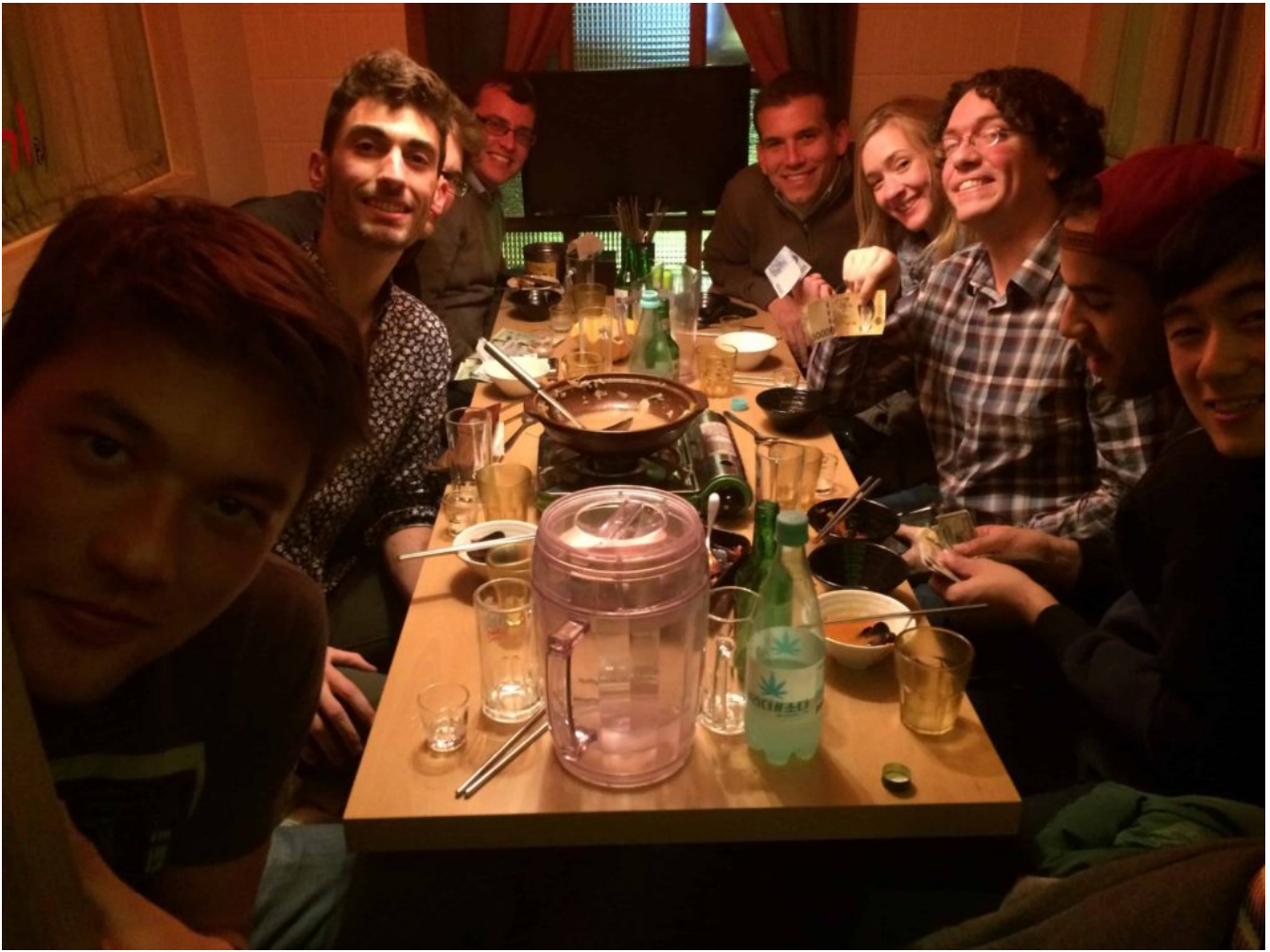
A group celebrating the day at Gangnam

As a close to the evening, we retreated to dorms, played cards, did our laundry chatted, and prepared our suitcases for the early departure next morning. We were coming back to the dorms in a few days (and looking forward to it!) so we thankfully could pack lighter.