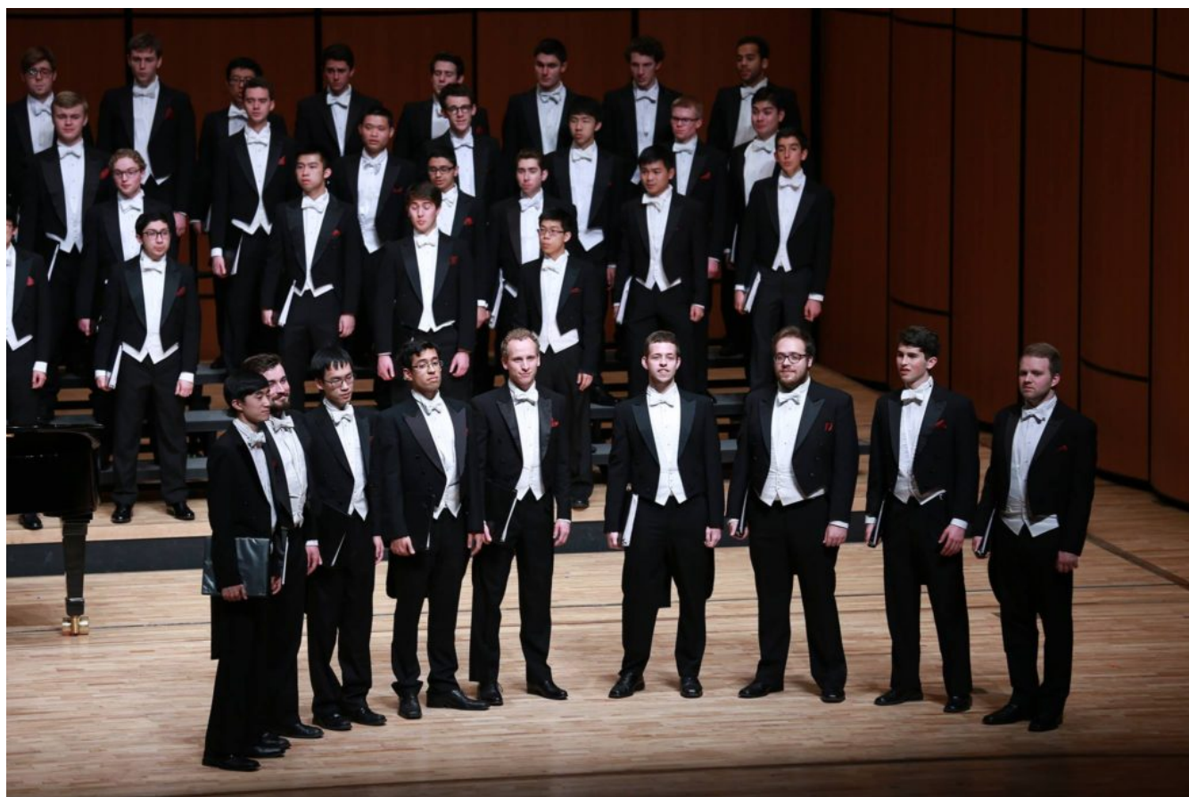
The Small group performs Glorious Apollo