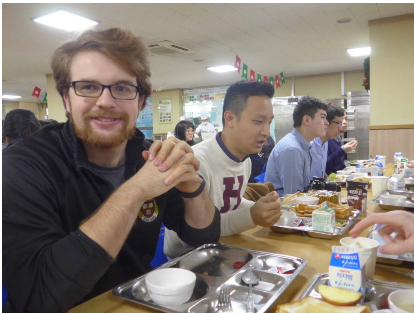
Gleeks at breakfast

The morning we all rose from our bunk beds and congregated for an 8am breakfast in one of the Korean International School cafeterias. The place was already bustling with students from the school receiving their meal; but though the line was long, the service was extremely efficient: we received a hodge-podge of items including cereal, juice, mushroom soup, ham, toast, salad, and fruit, all in one tray with slots of various shapes in sizes. Made me realize I miss high school cafeteria!