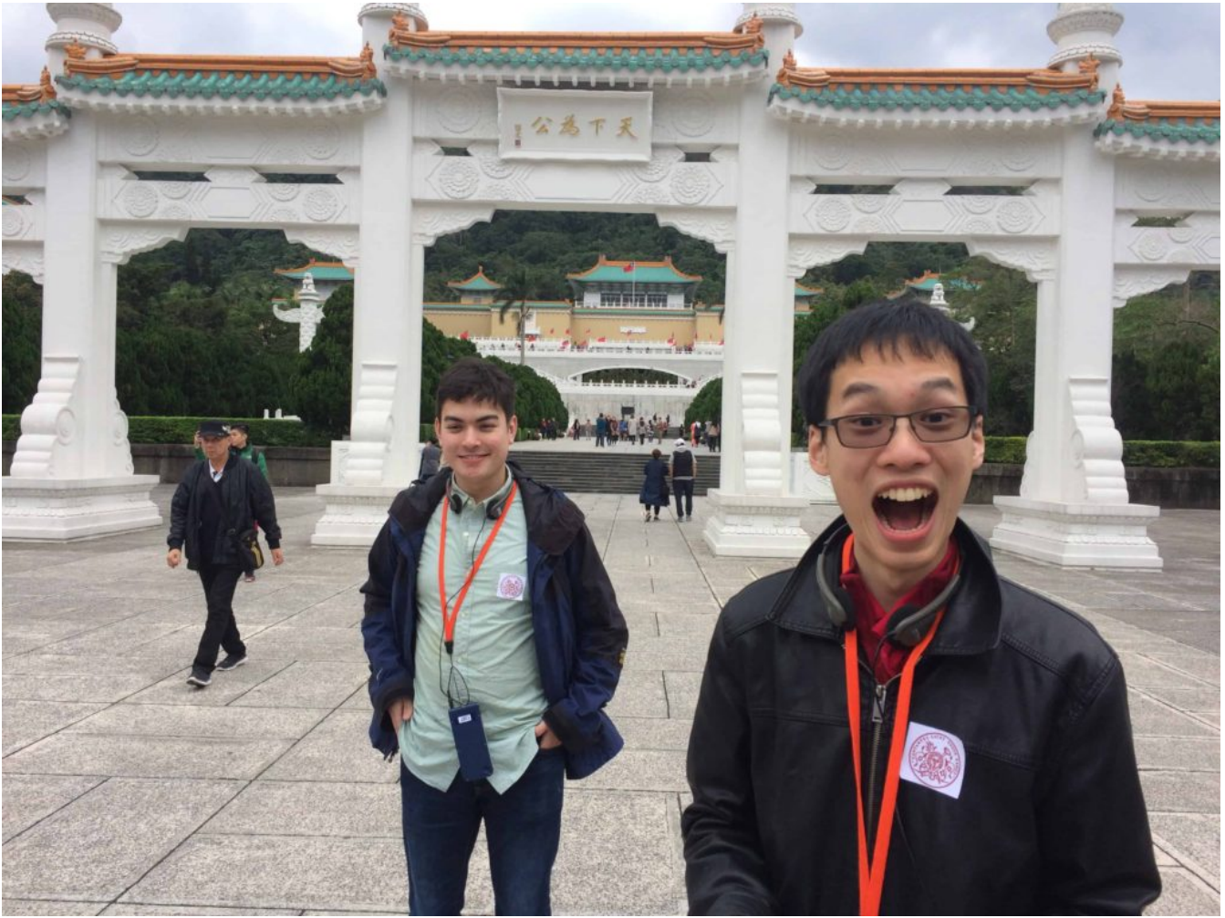
Gleeks in front of the entrance to the famed National Palace Museum

Students from the local Taiwan International School who had done extensive training with the museum docents gave us a guided tour of the museum, demonstrating their knowledge of the artifacts and their ability to navigate the large holiday crowds. As we listened through our headsets, we learned about emperors who put their stamp of approval on artwork, emperors who fell in love with their consort's younger sister, emperors who consoled their wife over the loss of their son by commissioning a group of chicken tea cups, emperors who created the first standardized weight of rice, emperors who build bells to commemorate their victories- many years of decadence, but also ingenuity and beauty. The museum was filled with ceramics, bronze, jade, paintings, and even some furniture, and painted a rich picture of Chinese history.