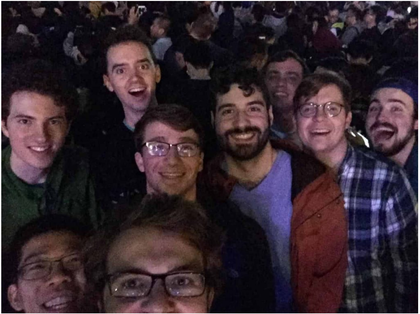
The Gleeks amidst the crowd at close to the Taipei 101 tower.

Another sizable group of Gleeks met at the Meiti Riverside Park, which gave us a clear view of the Taipei 101 tower but also plenty of space to congregate. We played cards, had a glass of wine and talked about the year before and ahead. As the countdown approached, we were all served a glass of champagne, and gathered by the riverside.