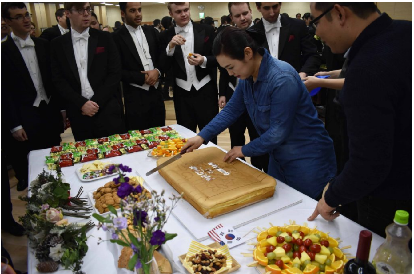
Gleeks await tasty food at the reception after the concert