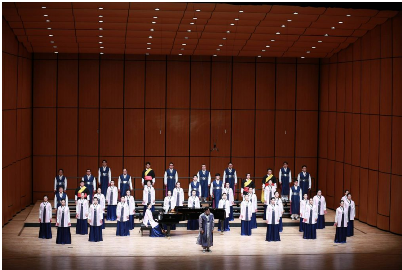
The Gunsan Civic Chorale performed the second half of their set in tradition garb

When it was our turn to go on, we knew we had to rise to the occasion. On the whole, we did. It was our best concert on tour so far, and during the football songs, the audience got in on the performance by clapping, albeit off-tempo.