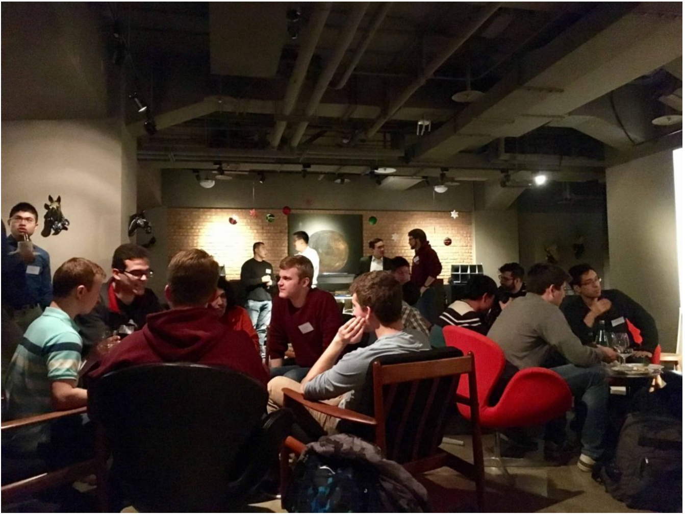
The fancy reception in the hotel basement

We then gradually returned to our hotel, which was a wonderful treat after nearly twenty-four hours of travel. Our rooms were each fitted with two single beds and have fully-equipped bathrooms which include toilets with heated seats and ornate controls. Suffice to say, we fell asleep quickly, our minds already looking ahead to the adventures which lay before us.