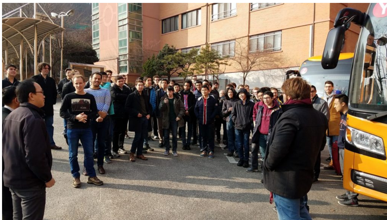
The Glee Club sings their farewells to KIS

The morning was spent busy packing in the KIS dormitories, along with a final breakfast in the busy highschool cafeteria for those that had the courage or energy left to wake up. Some, including myself, were a bit late to laundry process, and had to resort to laying out socks, underwear and shirts on the heated floor to make them dry faster than on the racks! Finally we met at 10:30am and loaded the two buses, and bid our farewell to the amazing KIS staff with our traditional “Domine Salvum Fac.” We set on the final leg of our journey: to Japan, the land of the Rising Sun!