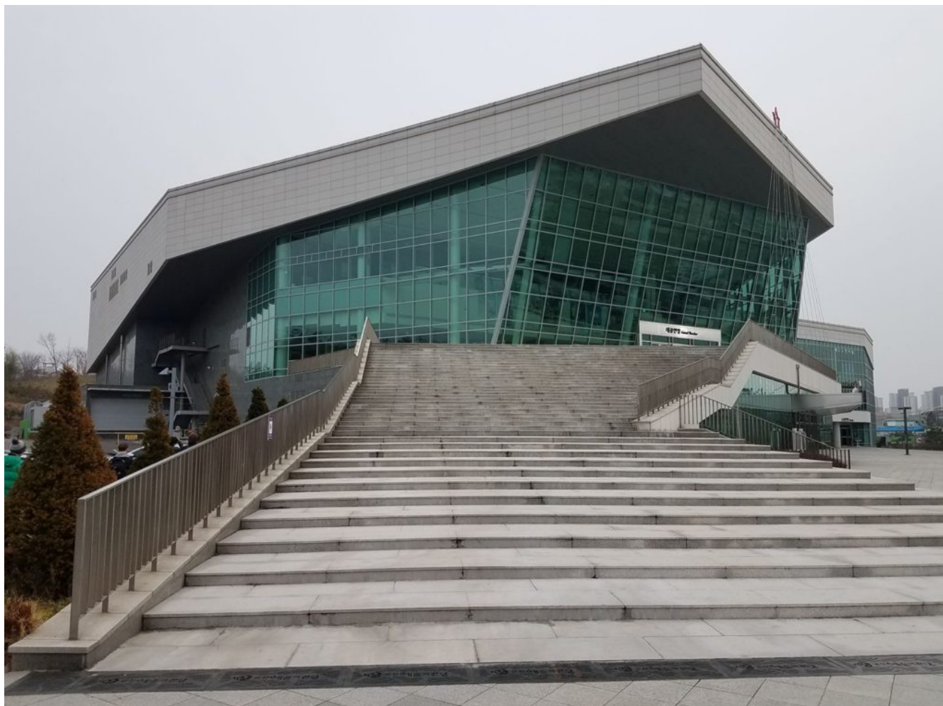
The Gunsan Arts Center – quite a sight!

The Art Center is a surprisingly expansive public work for such a small town. It was constructed in 2013, so its sleek, angular design was a bit incongruous next to the rest of the town, which was a bit smaller and more traditional. The other peculiar thing about the stage was that there was a large thrust, which made the audience seem far away. When we entered, we met the Gunsan Civic Chorale, a professional chorus, and rehearsed our joint pieces with them.