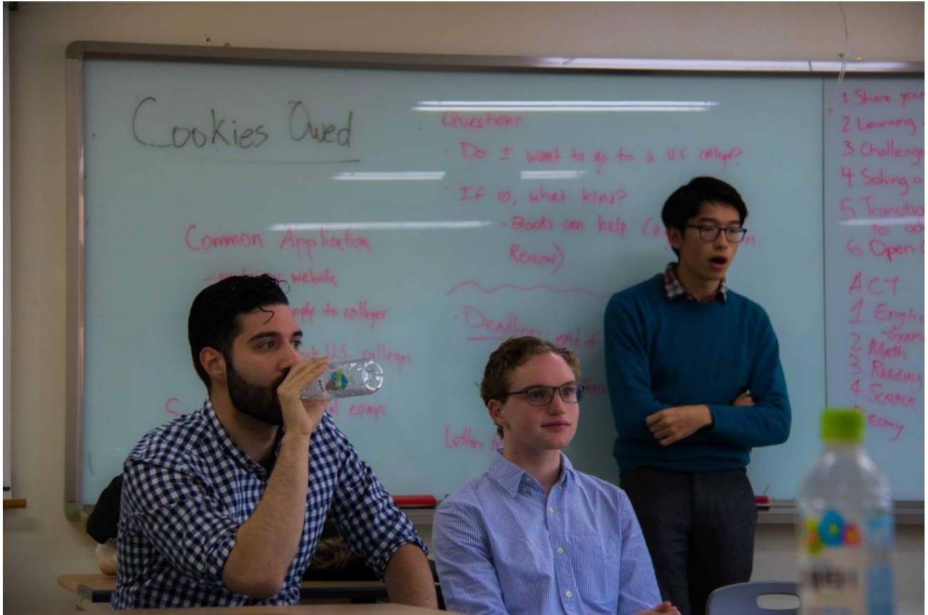
The leaders of a “Life at Harvard” workshop

saved by the personnel around). As we went along the tour we dispersed into the rooms in which we were to give our workshops. Half of the Glee Club was assigned to a morning session, while the other half was free to roam and prepare an afternoon session, and after lunch break the groups switched.