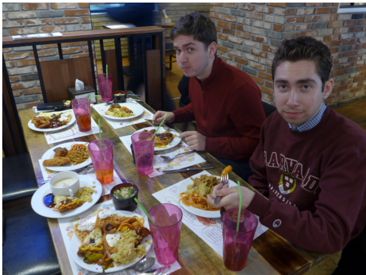
Two gleeks enjoying the amazing dinner buffet

The Gunsan Civic Chorale performed first during the concert, and it was then that we realized how good of a choir they were. During our rehearsal with them, our singing mixed in with their singing, making it hard to hear their group sound. When they were in performance mode, they were astounding. Dynamics, phrasing, tempo, pitch, and energy were just right. They got the most out of every piece, and their soloists were quite impressive.