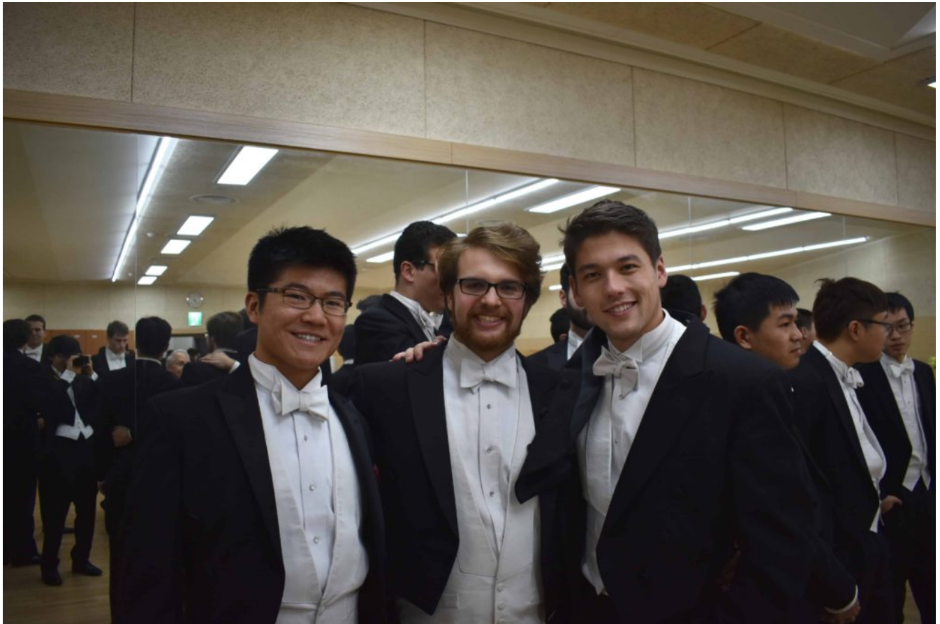
We rejoice after the concert