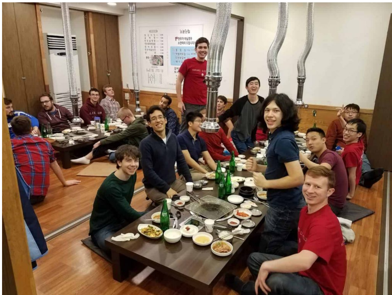
KIS led us to an excellent Korean Barbecue restaurant for our first meal in Korea

be our first meal in Korea. I was with the group that was given floor mats to sit on, but one could immediately notice that the floor mats were heated from underneath – how nice is it to be able to sit on the floor without being cold!