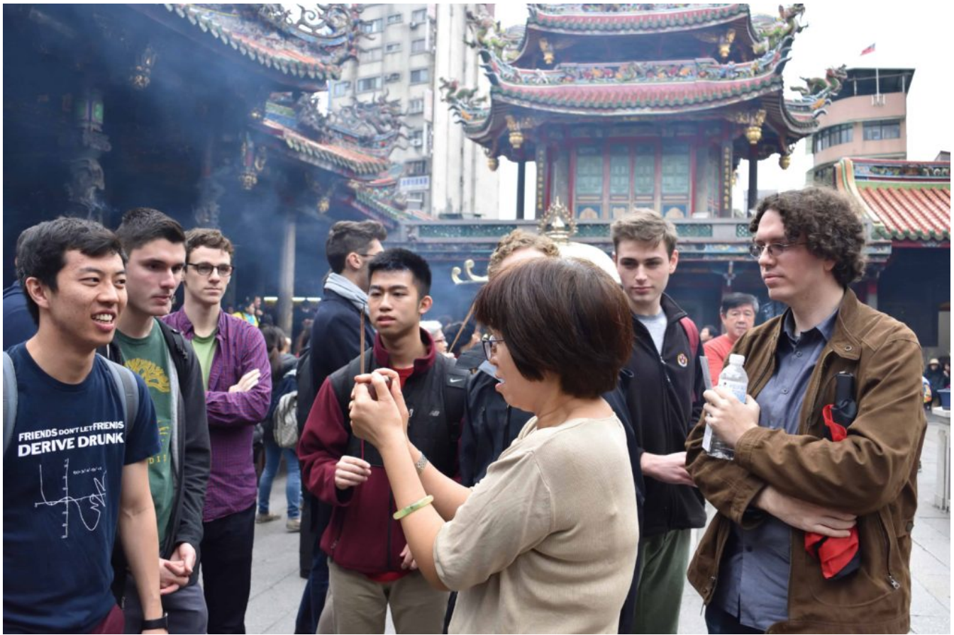
The tour guide shows us how to use the incense sticks

The tour guide narrated what goes on at the temple on a regular basis: people bring offerings of cakes, fruits, flowers, burn incense, toss stones, and pray to various different gods for success and wisdom. Several Gleeks took the opportunity to light incense and throw moon-shaped stones to ask the gods for advice on their own love lives and career plans.