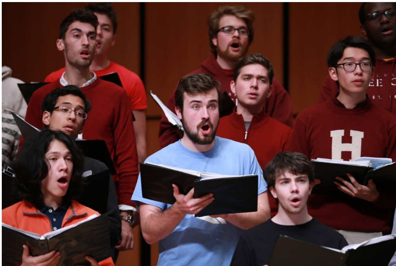
We rehearse our repertoire for the concert

Next on the schedule was dinner, a buffet at a place known for their pork cutlets. All-you-can-eat is always a good choice for the Glee Club, and we filled up on all kinds of tasty food.