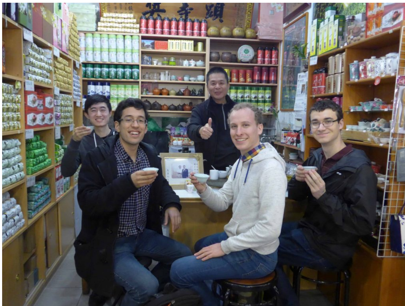
A group getting samples in a tea shop at the Shilin night market.