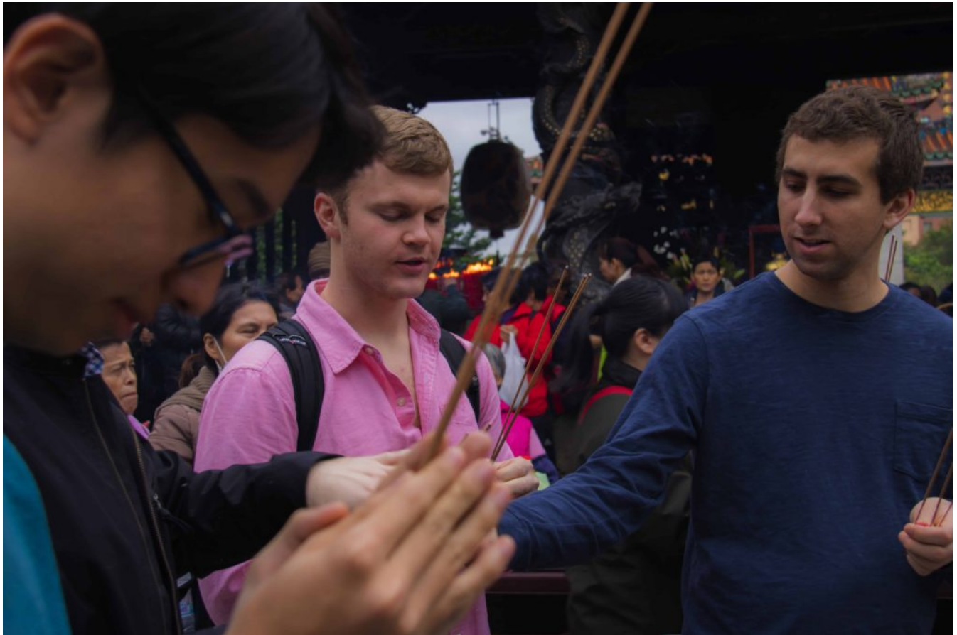
Gleeks meditating at the temple.

We ate lunch on the bus, a lunchbox of rice, cabbage, a tea egg, and a chicken cutlet, and then drove to the National Palace Museum.