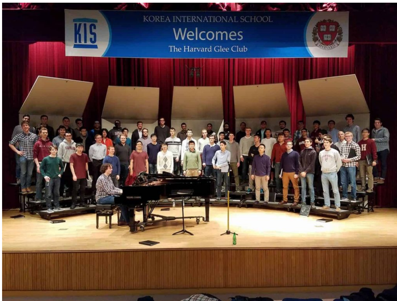
The group in rehearsal

After the more intense experience of the first concert in Taipei, we felt rather relaxed about the second concert, and we had a lot of fun in the process.