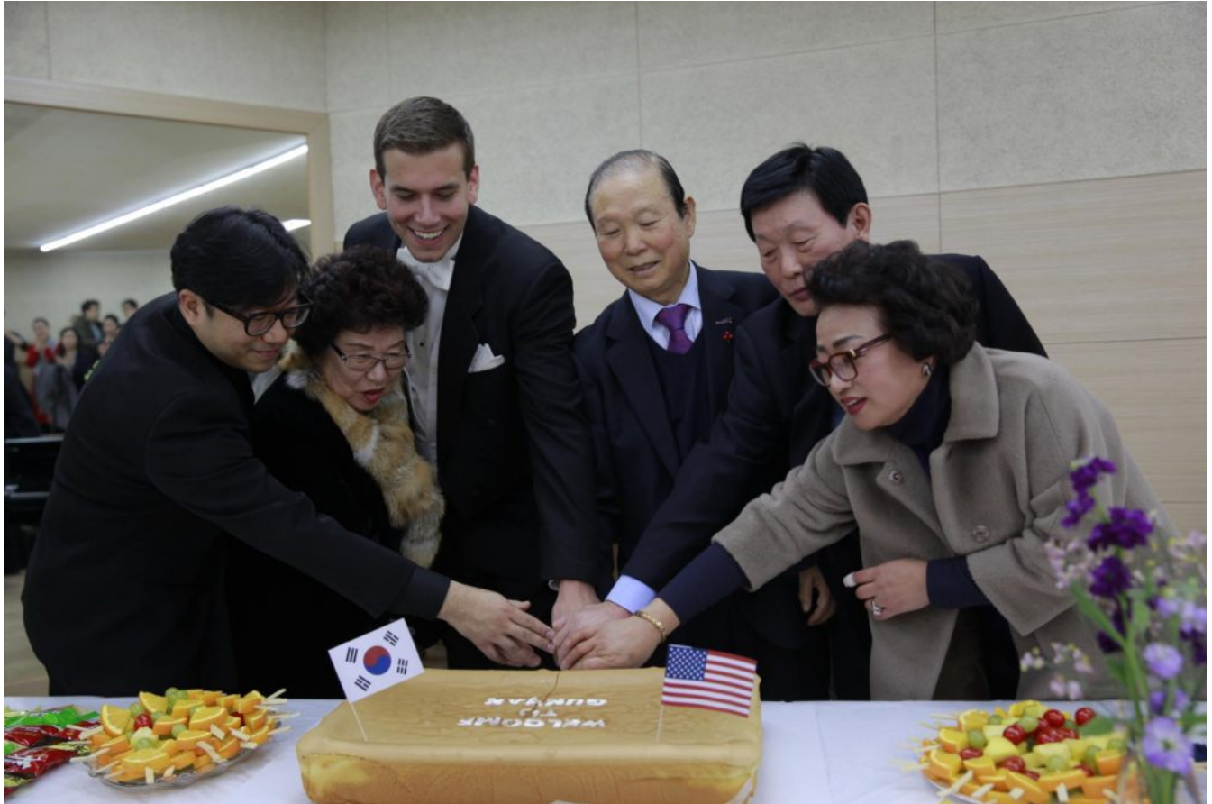
The mayor and Gunsan officials along with the two conductors cut the afterparty cake

After the performance, we attended a reception with the Chorus, during which time they gave us a plaque from the city of Gunsan, a framed commemorative poster from the concert, and food.