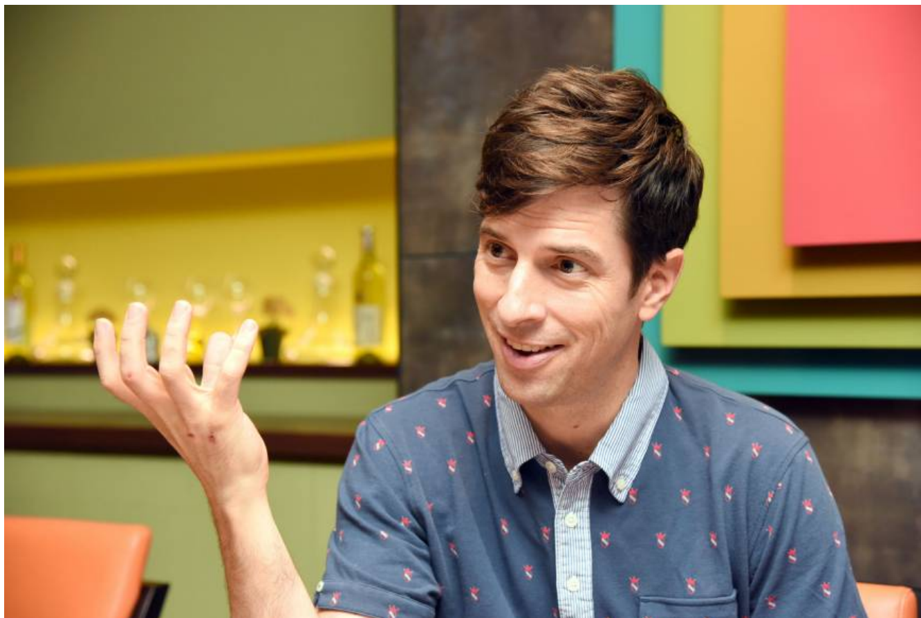
Look at this handsome man!

That’s a quick highlight of what we’re looking forward to bringing you as the tour goes on. Stay tuned for more information!