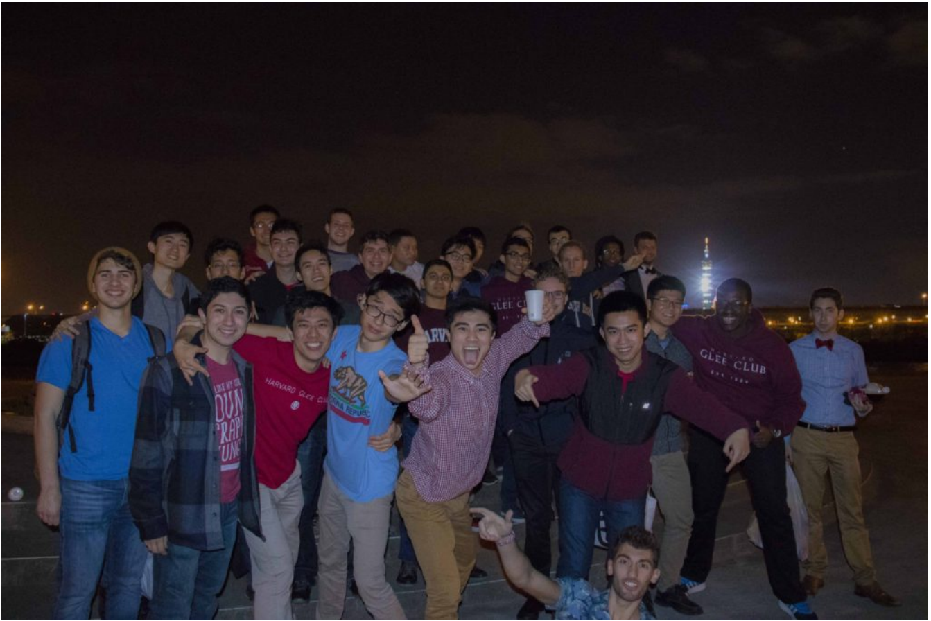
The group at the Meiti Park with Taipei 101 in the background.

We made it back two hours into the new year, and finally fell asleep.