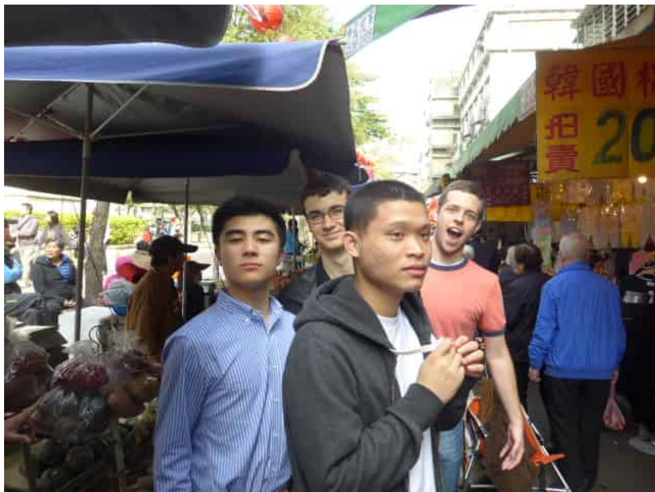
Gleeks tour the nearby fruit market

We all assembled in the lobby at 10am and all headed to the Management of New Arts building: we were to rehearse in the same Steinway piano shop that Lite had rehearsed in the previous day! We assembled, ready to start singing, and learned new Korean repertoire along with Korean pronunciation.