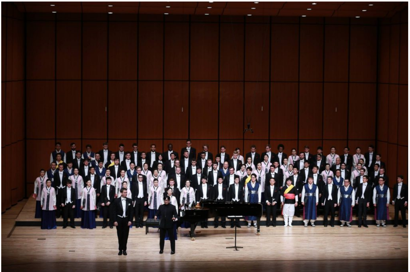
The two conductors salute the crowd