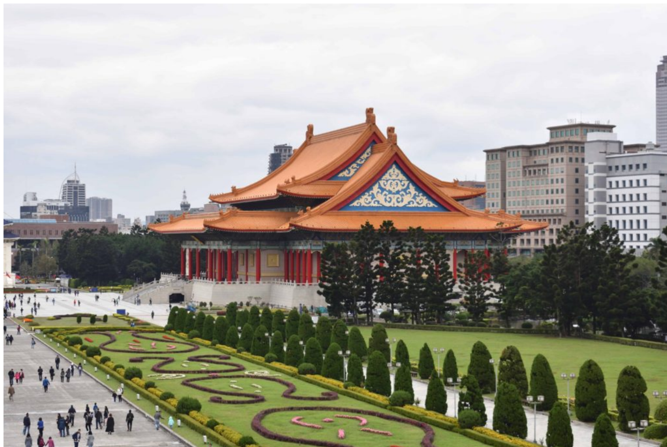
The National Concert Hall, where we will be performing on January 2nd

We took the elevator to the fourth floor, and watched the changing of the guard in front of the enormous statue of Chiang Kai-Shek. Following Chiang Kai-Shek's gaze, the memorial looked out over a grand courtyard at the National Theater and the National Concert Hall, where we will perform in a few days. On the ground floor, the tour guides took us around an exhibit displaying important artifacts from Chiang Kai-Shek's political and military careers.