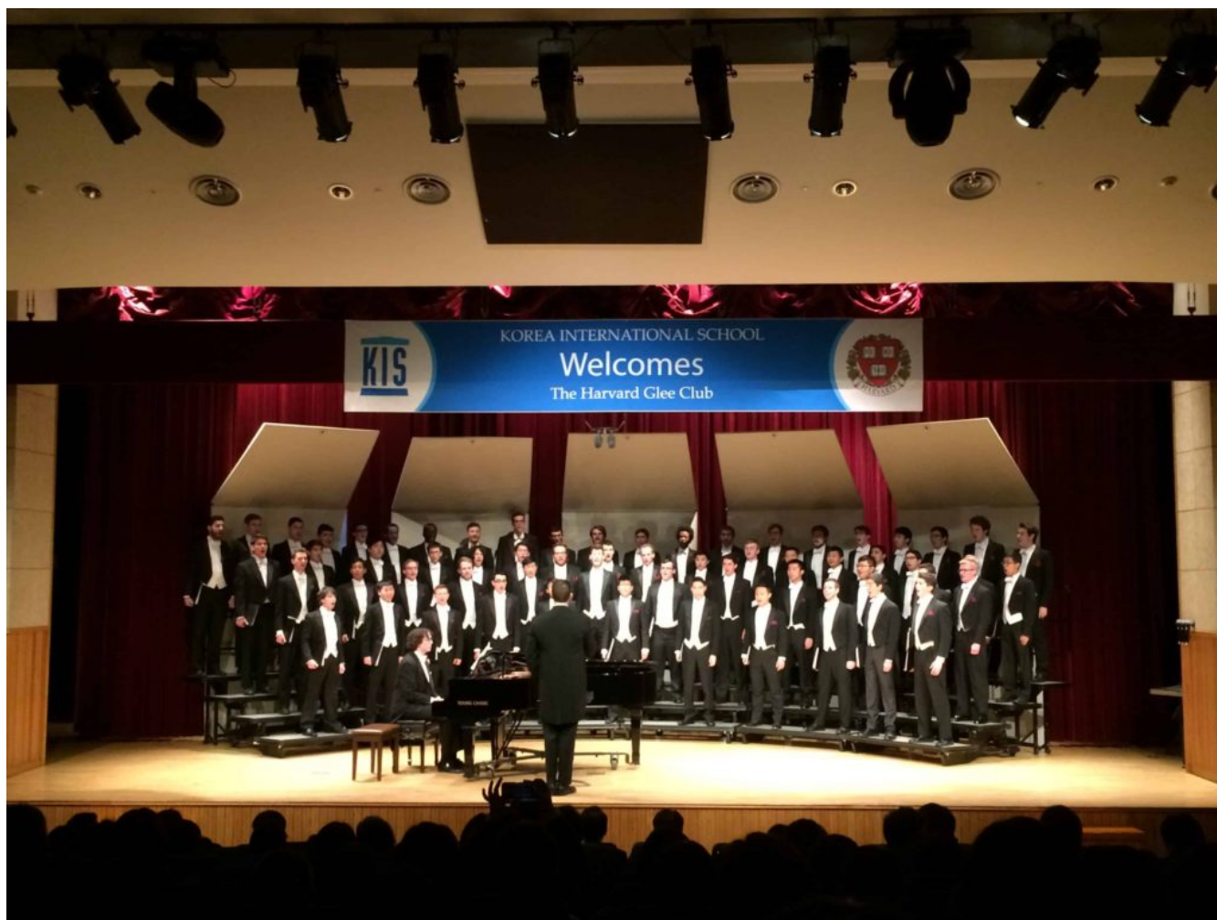
The Glee Club performing their recital

We mingled among the crowd as it left the hall, providing an occasion for many selfies and group photos. Finally we were greeted by the school officials including the founder of the school, for whom we sang our domine as a thanks for the fantastic exchange.