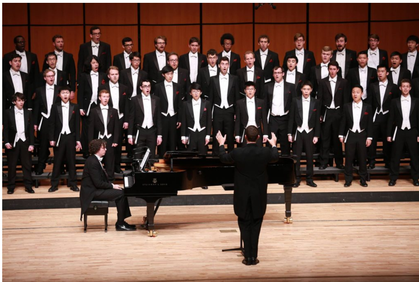
The Glee Club as it starts its concert