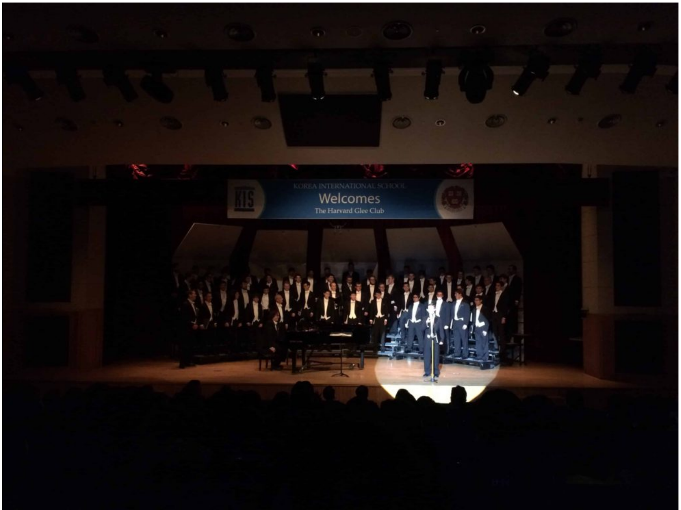
The spotlight hits our president

A few minutes after we stepped off the stage, we were surprised by a person telling us: “the audience is still clapping, they are waiting for an encore!” Lite was frantically reassembled and performed one more song to the cheers of the crowd.